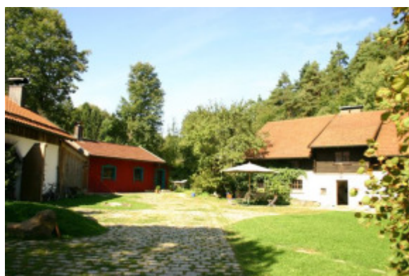
Inner yard, red house, main house

The other half is available for guests which find a seminar room, two dormitories and two rooms in the seminar house. In an other building is the sauna area and the communal bathroom.