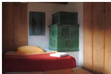
Dormitory and room in the seminar house